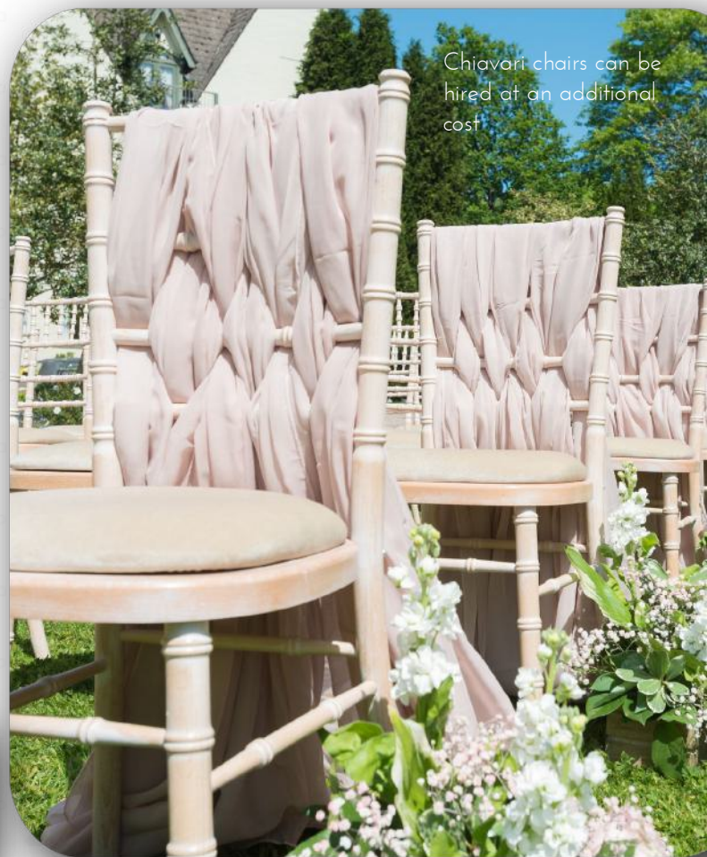
Chiavari chairs can be hired at an additional cost

For outdoor ceremonies, a microphone and sound system will be required. Hire charges apply - please ask for details