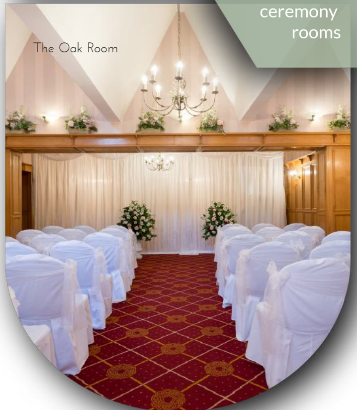
The Oak Room

A choice of four stunning ceremony rooms