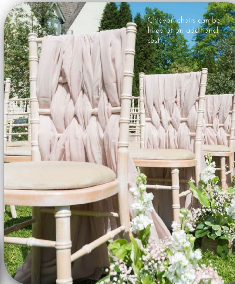
Chiavari chairs can be hired at an additional cost

For outdoor ceremonies, a microphone and sound system will be required. Hire charges apply - please ask for details